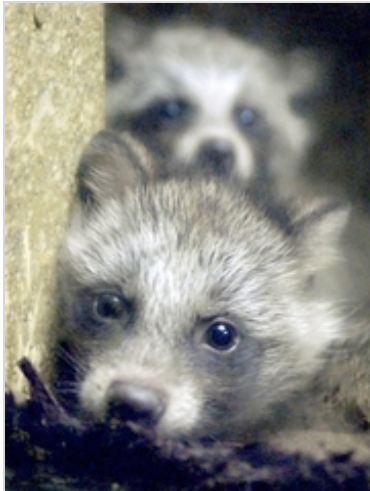
Two raccoon dog pups, and a third unseen pup, members of the canine family who...